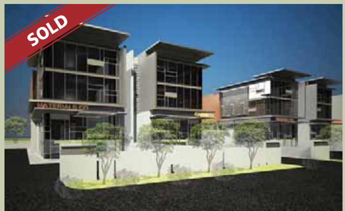
Nouvelle Kemuning Industrial Park (Bukit Rimau)