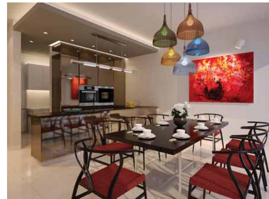
Impressively designed dining hall

It seduces you with its luxurious amenities, deluxe residences and architectural splendor plus impeccable designer touches. Living at The Treez – Jalil Residence @ Bukit Jalil , your senses will be elevated even higher.