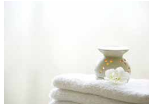
Stylish bathroom designed for ultimate comfort and personal indulgence

Master Suite Offers More Than A Good Night Sleep