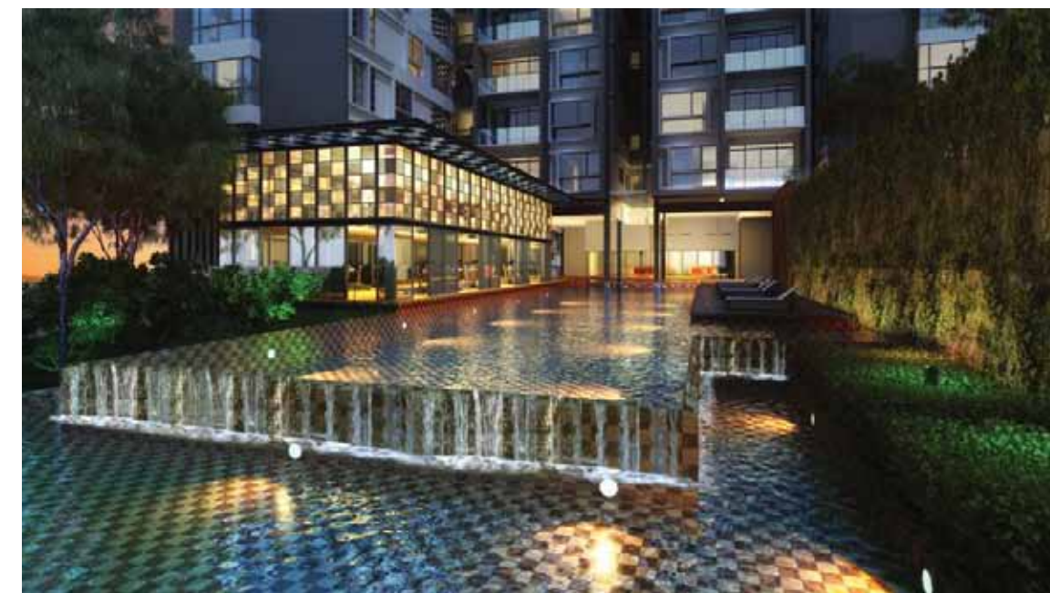
25m Infinity Edged Swimming Pool With Stunning View

Experience the therapeutic goodness of the contemporary resort atmosphere