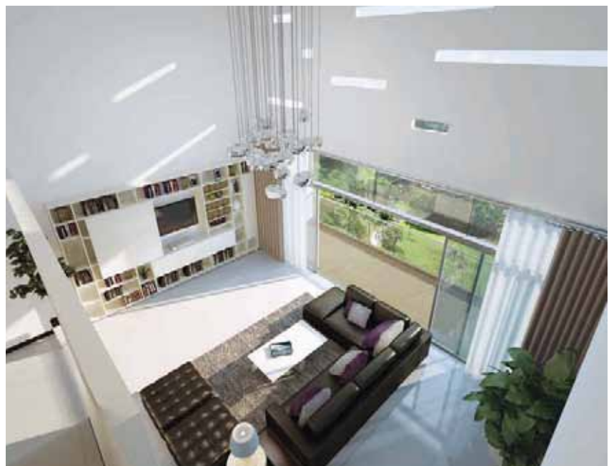
A home that radiates luxury

Each and every unit here is designed to evoke a sense of contemporary elegance that is as functional as they are beautiful. The exceptional interior finishes reinforce our commitment to superior design and value.