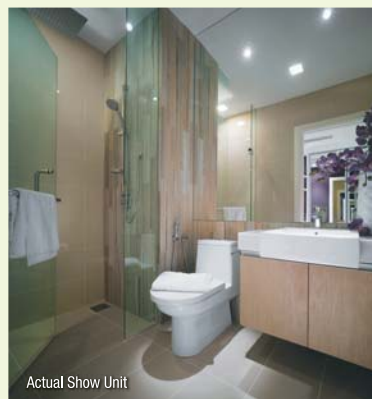
Actual Show Unit