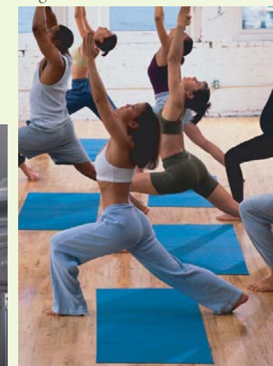
Yoga / Meditation Room