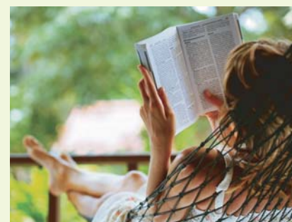
Hammock Pool in Palm Grove