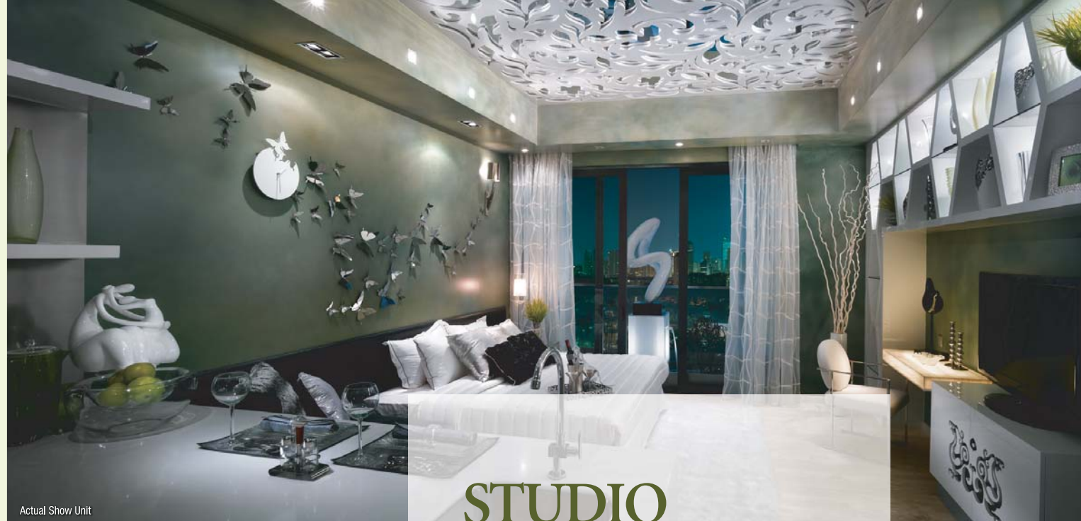
Actual Show Unit