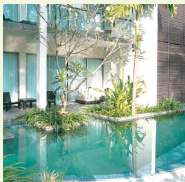
Serene Lagoon View