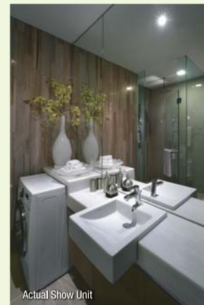
Actual Show Unit

Contemporary design blends flexible layout in a clever interior design that combines the living, bedroom and kitchen in one spacious voluminous room for easy living.