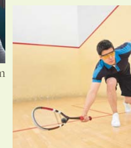
Indoor Squash Court