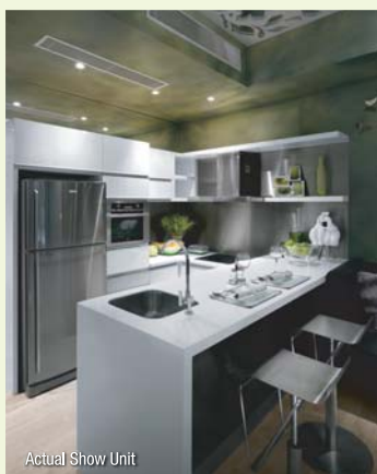
Actual Show Unit