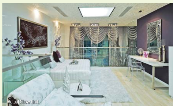
Actual Show Unit

Big on space, versatile in layout. Enjoy breathtaking vistas of hanging gardens, convenient dual entry-access and luxurious comfort.