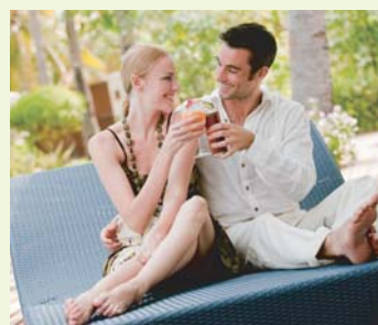
Sky Forest Social Corner