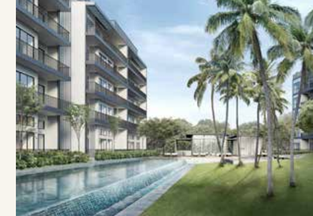
VILLAGE AT PASIR PANJANG DISTRICT 5, SINGAPORE

Incorporated in 1962, Selangor Dredging Berhad (SDB) was, until the 1980's principally involved in tin mining. Today, SDB is positioned as a quality lifestyle company focused on property-related activities. Listed on Bursa Malaysia, SDB owns Wisma Selangor Dredging – a prestigious business address, and Hotel Maya Kuala Lumpur – an award-winning boutique urban resort. Both are within a short walking distance to the iconic Kuala Lumpur City Centre (KLCC). Today, SDB is a brand name that is recognised for its niche luxury developments and innovative designs. SDB has consistently been recognised for its innovation and its excellence by numerous professional bodies such as Singapore Institute of Architects (SIA), Pertubuhan Arkitek Malaysia (PAM), and International Real Estate Federation (FIABCI) for setting new benchmarks in the industry. SDB is committed to its brand promise of "Driving Excellence, Building Lifelong Relationships".