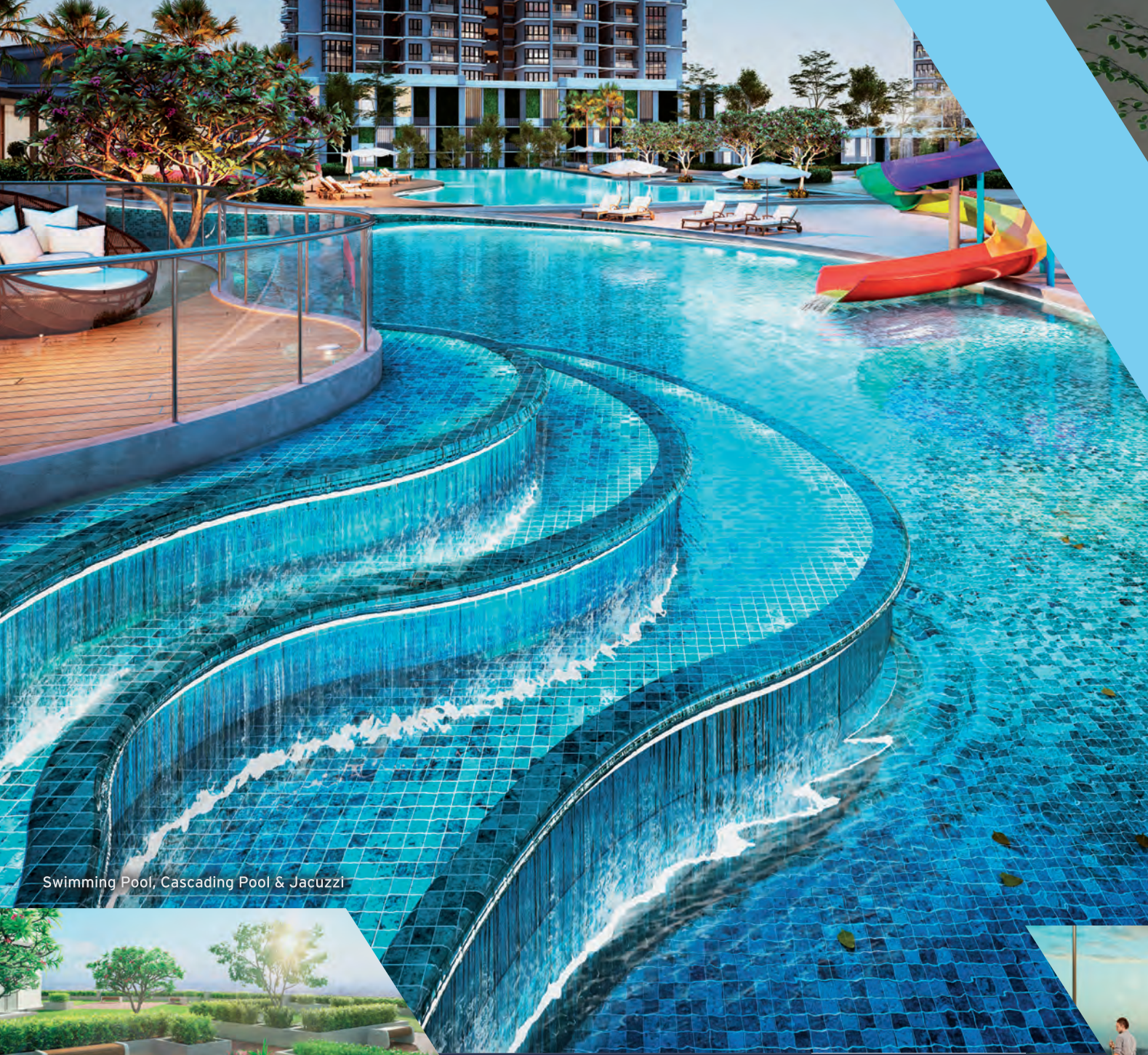
Swimming Pool, Cascading Pool & Jacuzzi