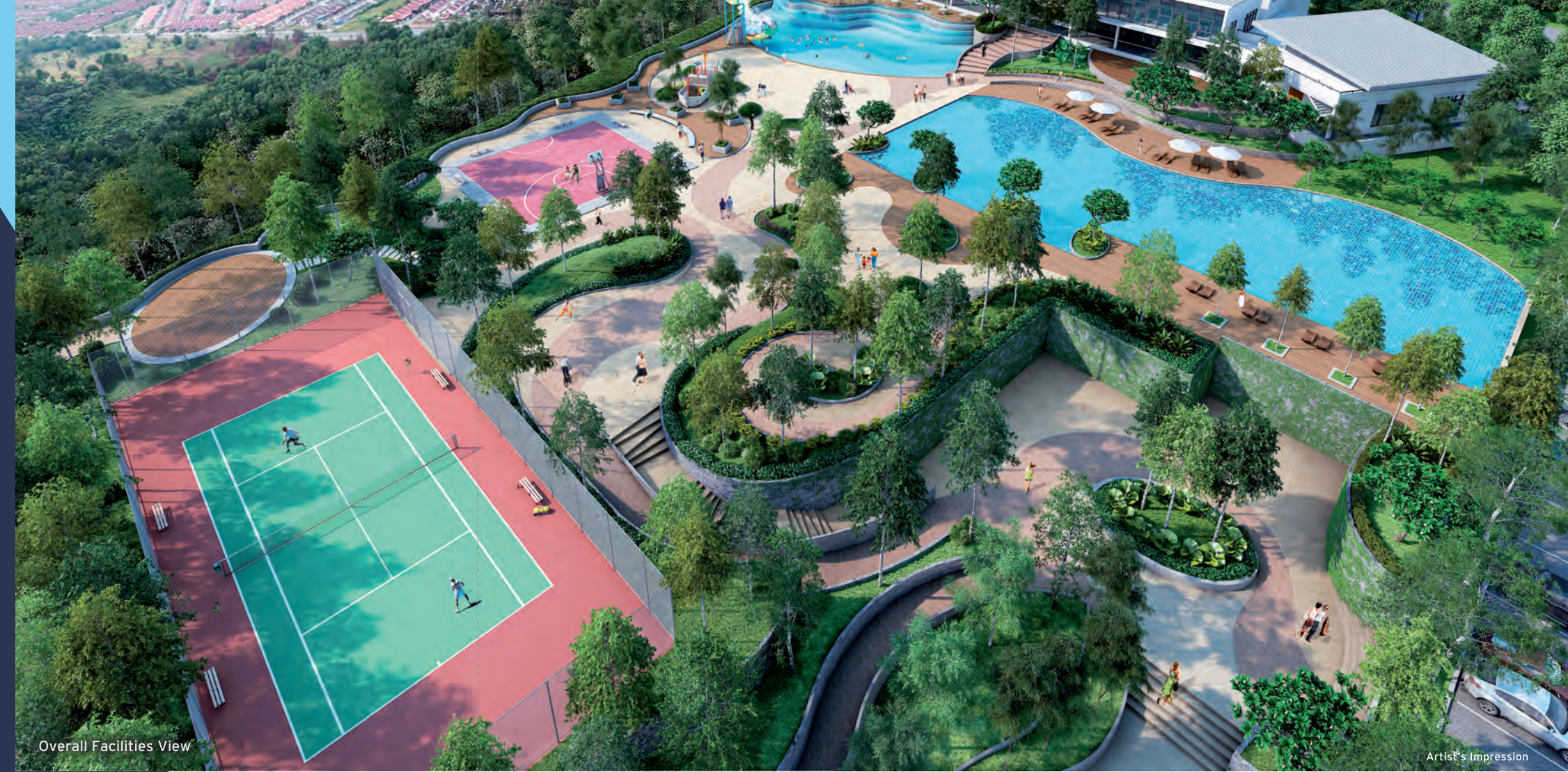
Overall Facilities View